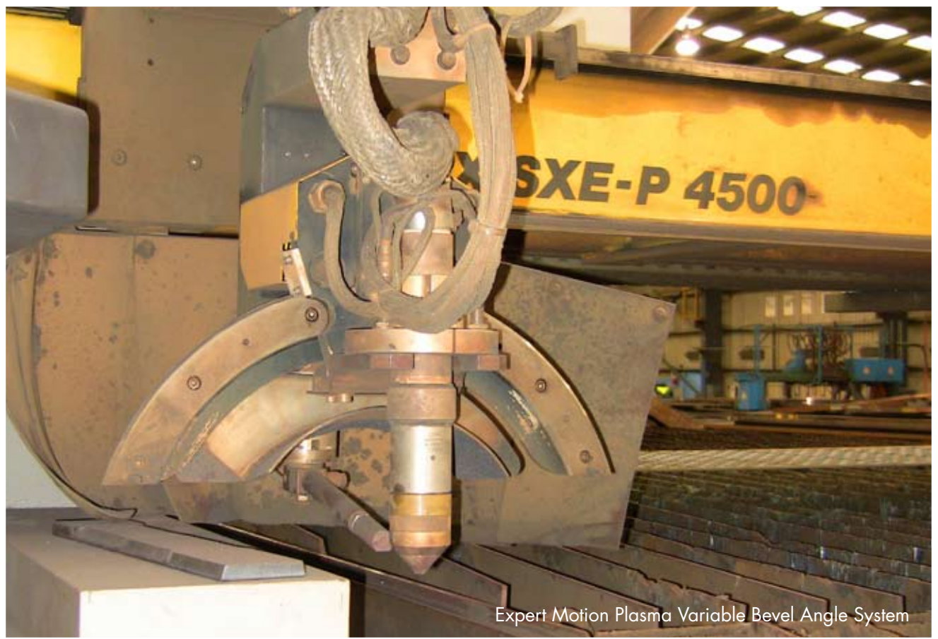
Expert Motion Plasma Variable Bevel Angle System

Surdex Plate Processing uses the Expert Motion Plasma Variable Bevel Angle System to accurately bevel cut plate. The system is fully programmable to produce parts that have both bevel and straight cuts. A single plasma torch is controlled via servo motors in three axes: tilt, rotation and vertical height. Surdex's equipment allows unequalled control of bevel cutting with parameters such as speed, kerf and tilt angle all automatically adjusted for various material thicknesses and bevel angles.